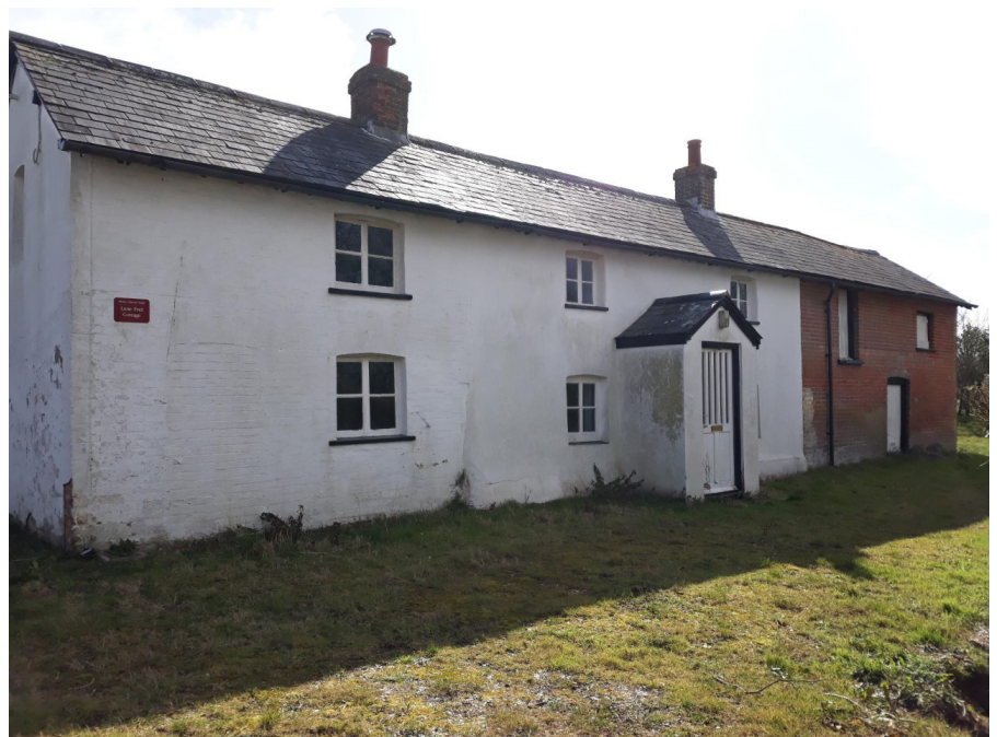
Quantities are based on figures as at June 2021.